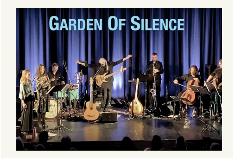
Live Teaser "Wander Song" PROGR Bern (CH) Feb. 2024